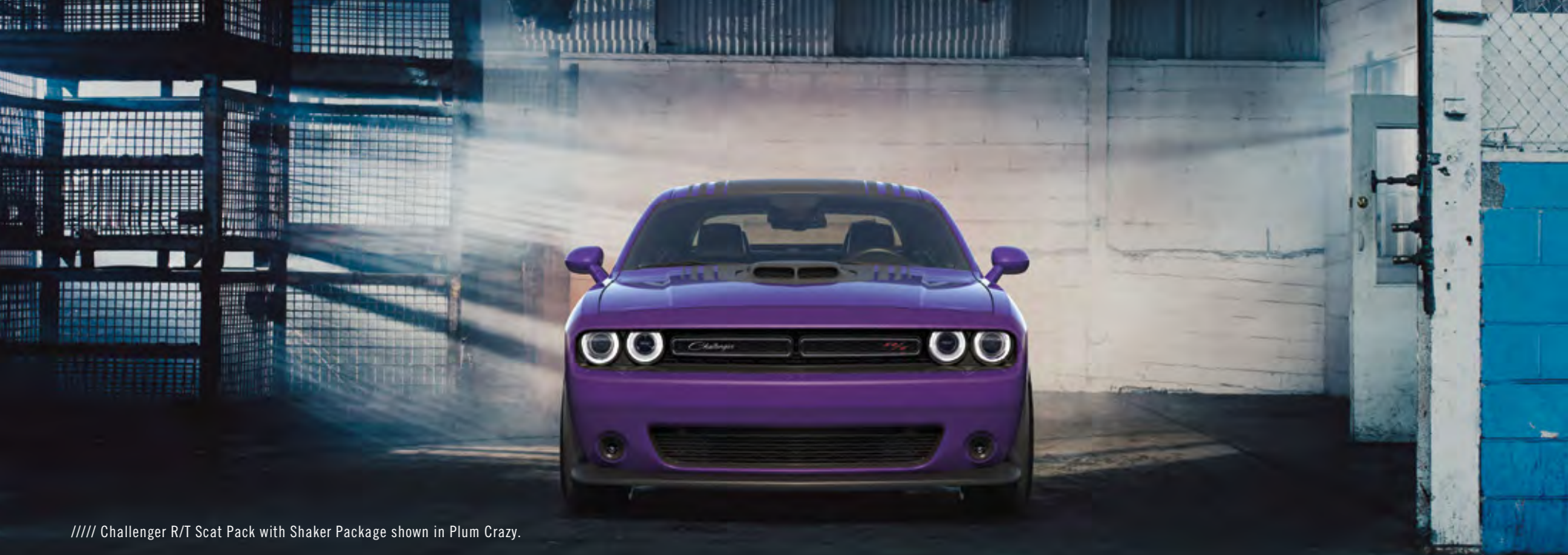
///// Challenger R/T Scat Pack with Shaker Package shown in Plum Crazy.