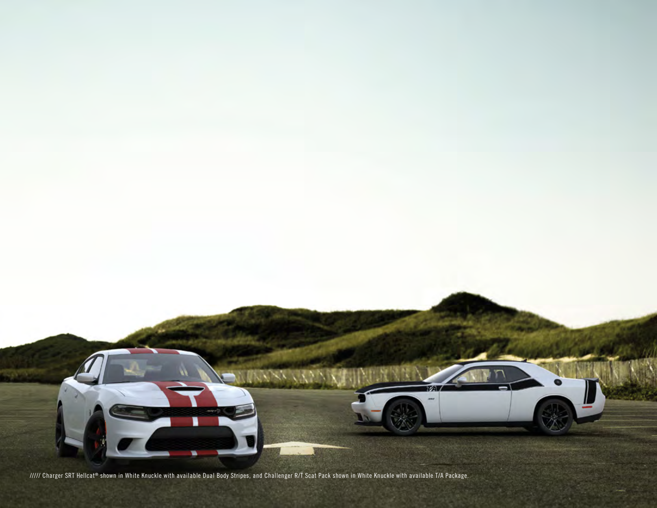
////// Charger SRT Hellcat® shown in White Knuckle with available Dual Body Stripes, and Challenger R/T Scat Pack shown in White Knuckle with available T/A Package.