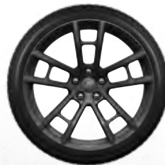
20x9.5-inch Low-Gloss Black Forged Aluminum (WRV) – Included with T/A Package on R/T Scat Pack on Challenger; Included with Dynamics Package on R/T Scat Pack with Shaker Package on Challenger; Included with Daytona Edition Group on Scat Pack on Charger