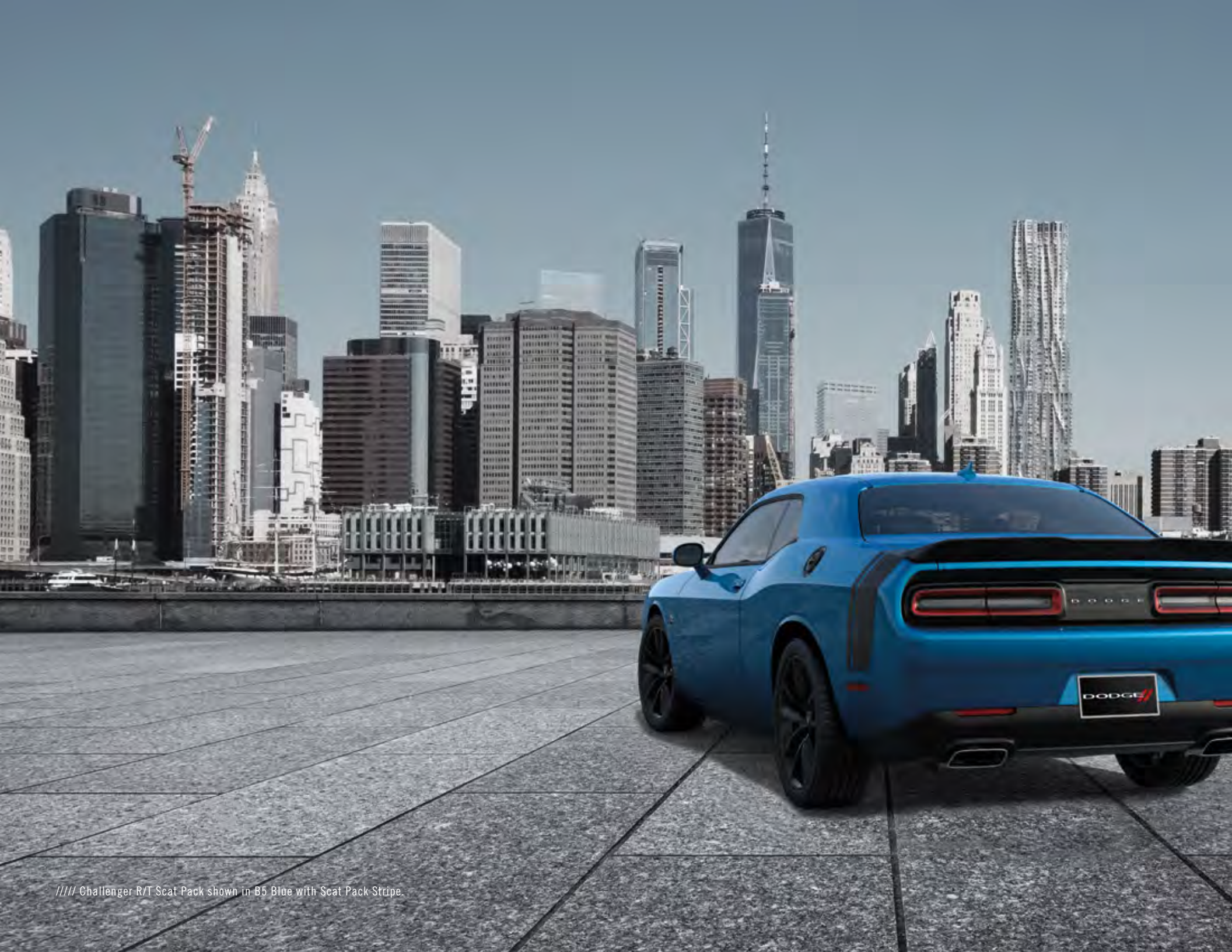
////// Challenger R/T Scat Pack shown in B5 Blue with Scat Pack Stripe.