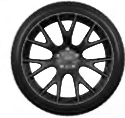
20x9.5-inch Low-Gloss Black Lightweight Forged Aluminum (WH3) – Included with Performance Plus on R/T and Dynamics Package on R/T Scat Pack on Charger; Optional on SRT Hellcat® on Challenger and Charger.