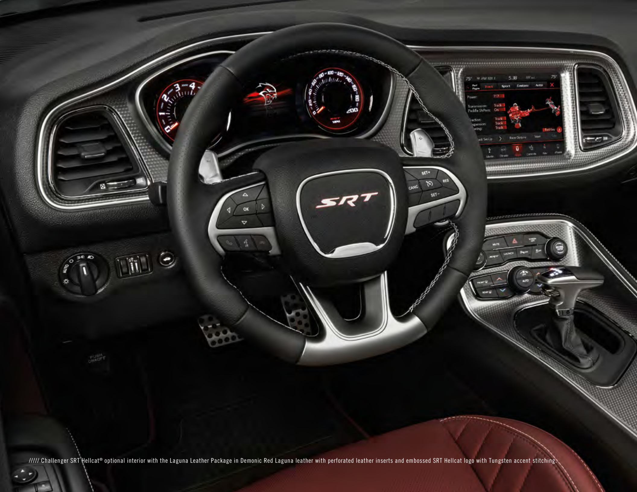
////// Challenger SRT Hellcat® optional interior with the Laguna Leather Package in Demonic Red Laguna leather with perforated leather inserts and embossed SRT Hellcat logo with Tungsten accent stitching.