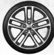
19-inch Polished Aluminum with Dark Pockets (WS1) – Standard on SXT AWD and GT AWD on Challenger; Standard on SXT AWD on Charger