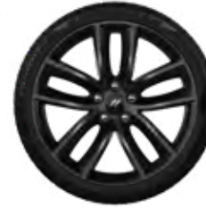
20x9-inch Black Noise Aluminum (WRW) – Standard on R/T Scat Pack; Packaged with Performance Handling Group on GT and R/T on Challenger and Charger