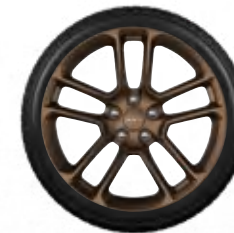
20x9.5-inch Brass Monkey Lightweight Forged Aluminum (WRJ) – Optional on SRT Hellcat on Challenger and Charger