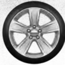
18-inch Satin Carbon Aluminum (WK1) – Standard on Challenger SXT