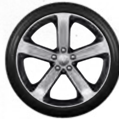
20-inch Polished Aluminum with Black Pockets and Satin Finish (WSN) – Optional on GT and R/T on Challenger and Charger