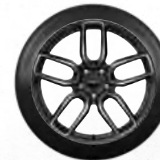
20x11-inch Devil's Rim Forged Aluminum (WSC) – Included with Widebody Package on R/T Scat Pack and SRT Hellcat on Challenger