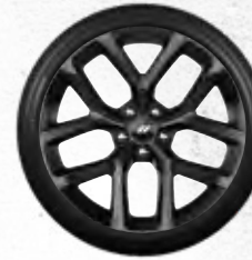
20-inch Black Noise Aluminum (WRE) – Included with Blacktop Package on SXT, GT and R/T on Challenger and Charger