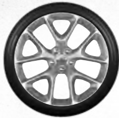
20-inch Satin Carbon Aluminum (WPZ) – Included with Plus Package on GT and R/T on Challenger and Charger