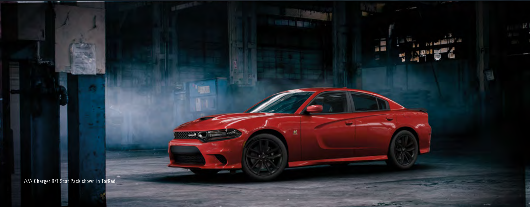
///// Charger R/T Scat Pack shown in TorRed.