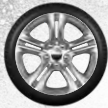
17-inch Fine Silver Aluminum (WAE) – Standard on Charger SXT