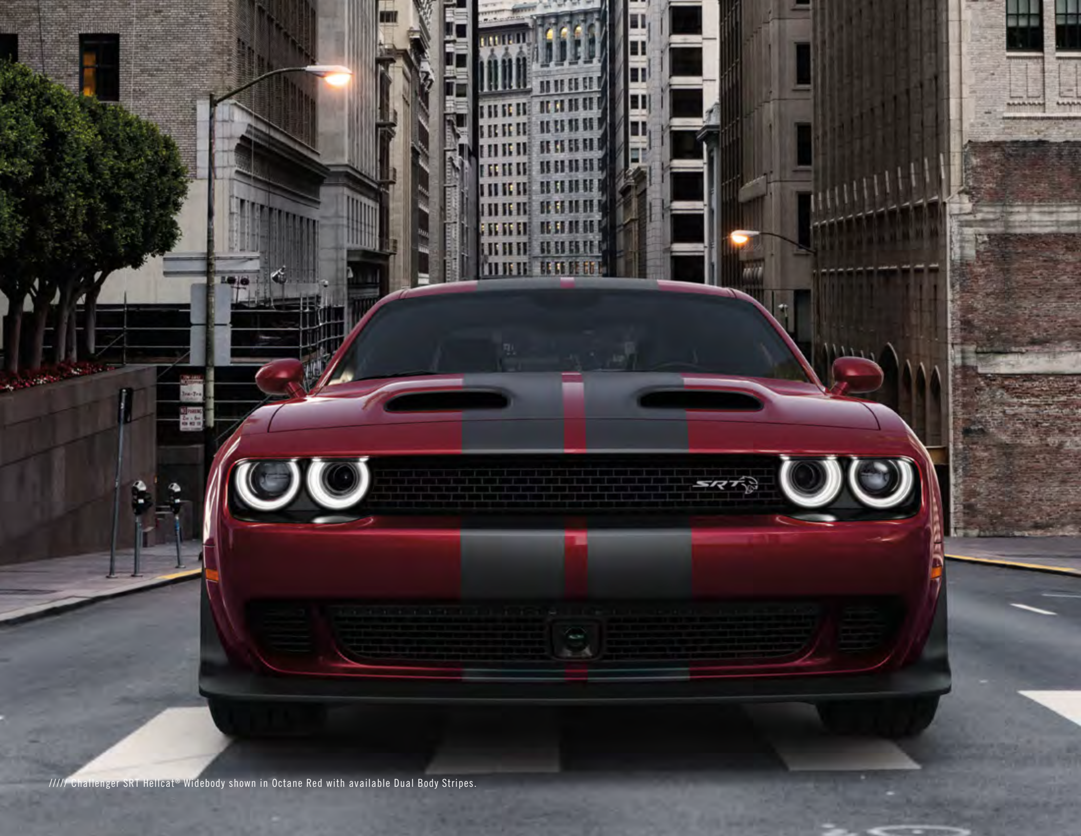
////// Challenger SRT Hellcat® Widebody shown in Octane Red with available Dual Body Stripes.