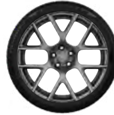
20x9-inch Low-Gloss Granite Crystal Lightweight Forged Aluminum (WRT) – Optional on GT with Performance Handling Group and on R/T and Scat Pack and packaged to the T/A 5.7L on Challenger; Optional on GT with Performance Handling Group and on R/T and Scat Pack; Packaged to Daytona 5.7L on Charger