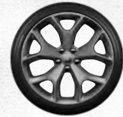
20-inch Granite Crystal Aluminum (WHB) – Standard on GT and R/T; Included with Plus Group on SXT on Challenger and Charger