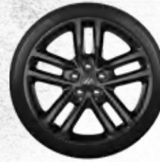
19-inch Black Noise Aluminum (WS6) – Included with Blacktop Package on SXT AWD and GT AWD on Challenger; Included with Blacktop Package on SXT AWD on Charger