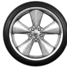
20-inch Classic II Polished Forged Aluminum (WHD) – Included with R/T Classic Package on Challenger R/T