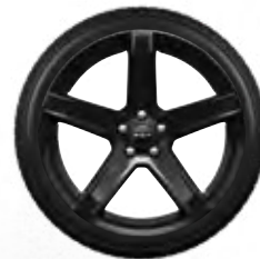
20x9.5-inch Low-Gloss Black 5 Deep Lightweight Aluminum (WEB) – Standard on SRT Hellcat and Charger