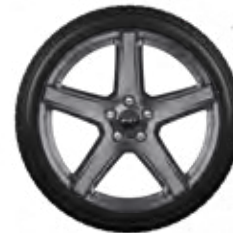
20x9.5-inch Matte Vapor 5 Deep Lightweight Aluminum (WSE) – Optional on SRT Hellcat on Challenger and Charger